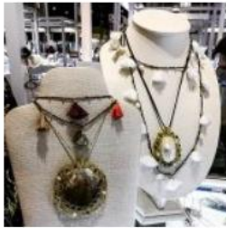
Necklaces by Jiratha Dechosathit

Of course, Bangkok is colored-stone heaven, and BGJF is living proof: There are more than 300 (count 'em, 300!) booths selling loose gems. Emeralds and rubies are the reigning king and queen of the fair—JCK LUXURY mainstay Takat has dedicated more than half of its ample booth space here to its signature eye-popping emeralds—but we spotted a surprising amount of peridot; piles of Ethiopian opal (but very little Mexican or Australian); some gorgeous tourmaline (Azizi should be your go-to for Paraiba, bicolor, and rubellite); and beautiful spinel in shades including blue, purple, and red (a great alternative price-wise to rubies, noted recent JCK Tucson exhibitor Dazzle Gems).